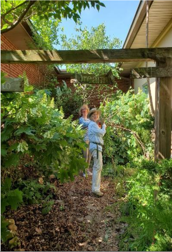
Fairview Elementary School in Maryville -Project of Mountain Laurel Garden Club