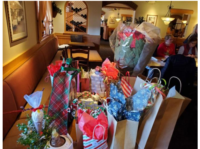
The party ended with a gift exchange.