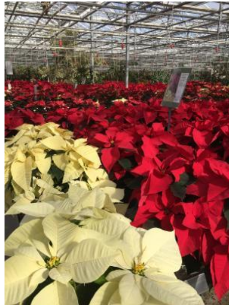
Ready to take home.