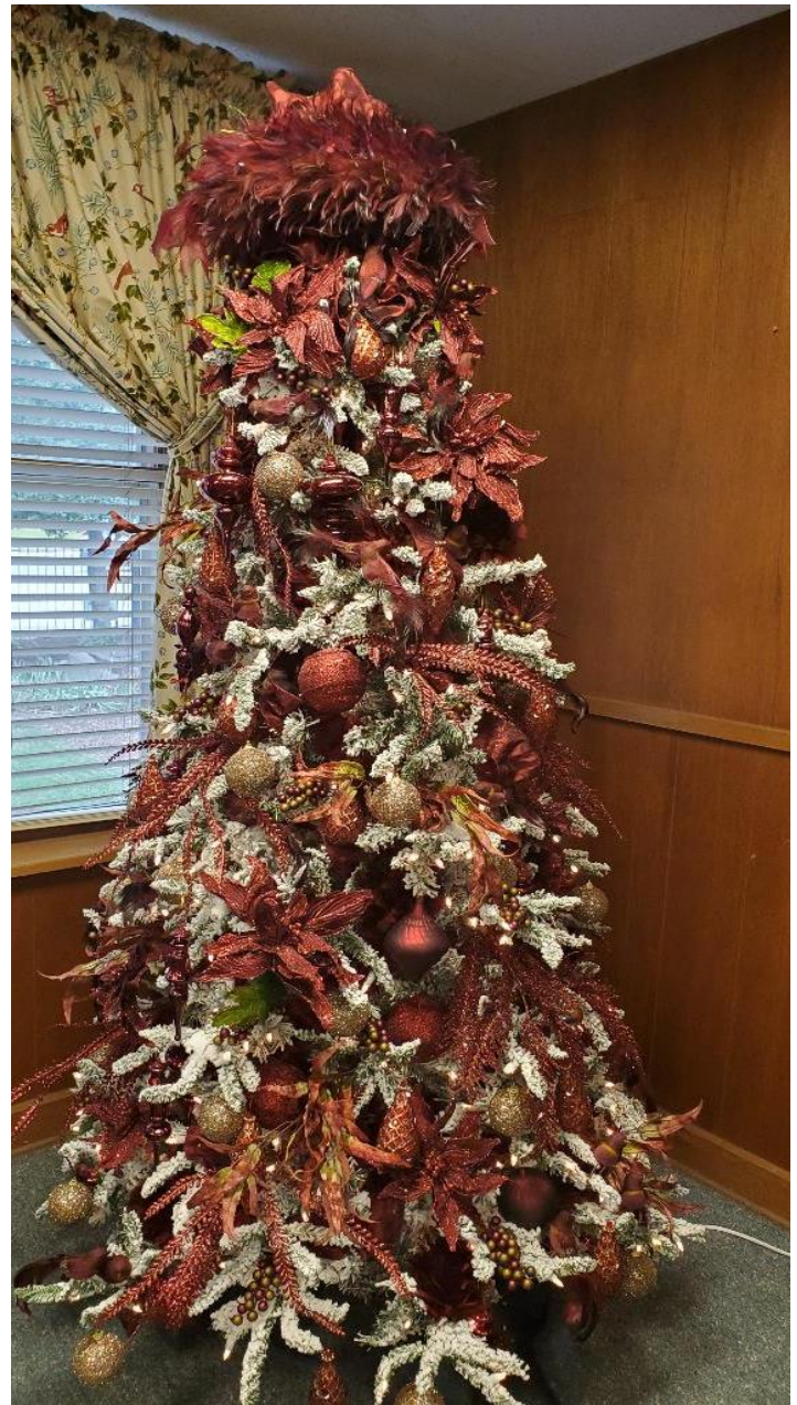
The Scarlett Tree designed by Julia Shiflett on display at Racheff.