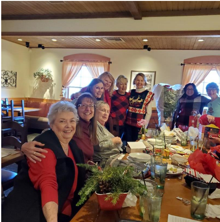
The Tuckaleechee Garden Club's annual Christmas gathering was held at Olive Garden in Alcoa.