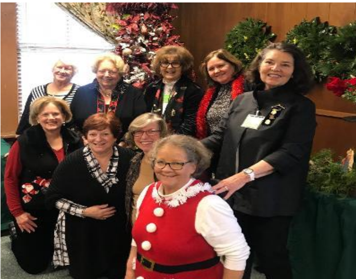
Dixie Highway Garden Club members attending the IRH & G Annual Greens Tea.