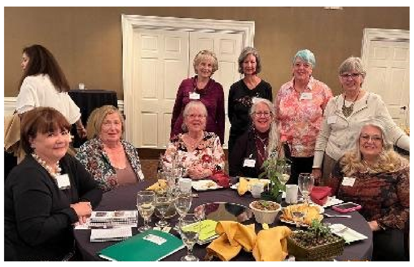
Sevierville Garden Club members at the Fox Den Country Club Fall DIV Membership meeting.