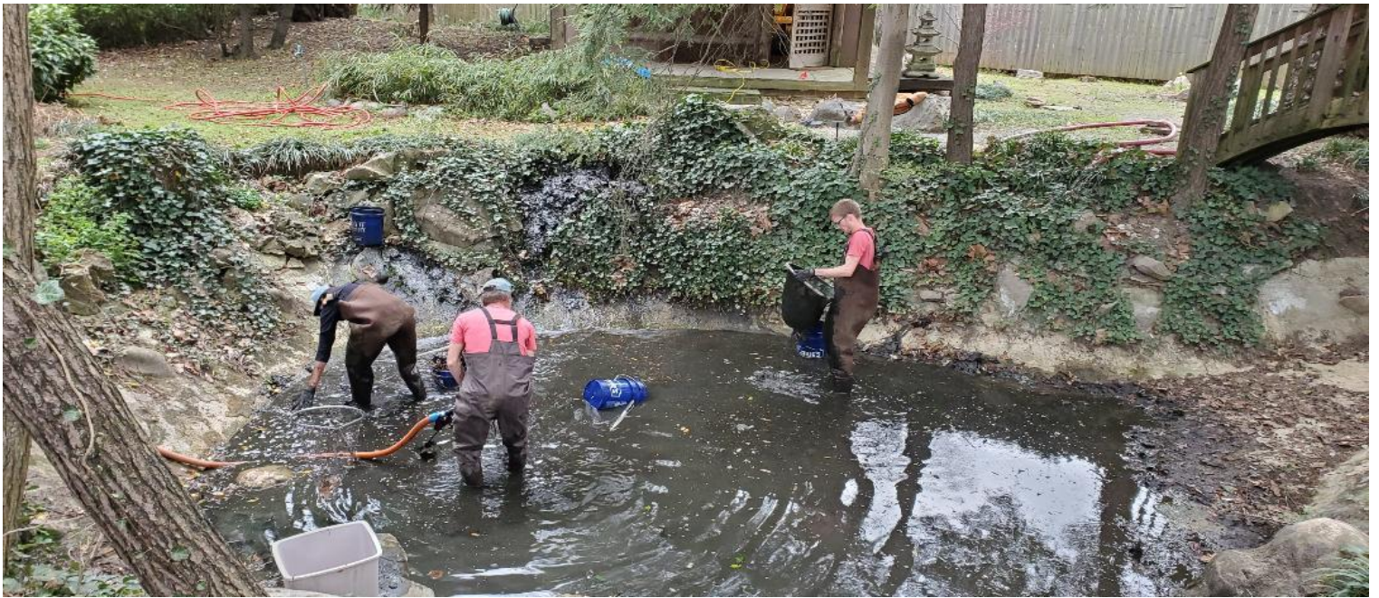
The pond at Racheff has been cleaned!! It is beautiful – GO SEE IT!!