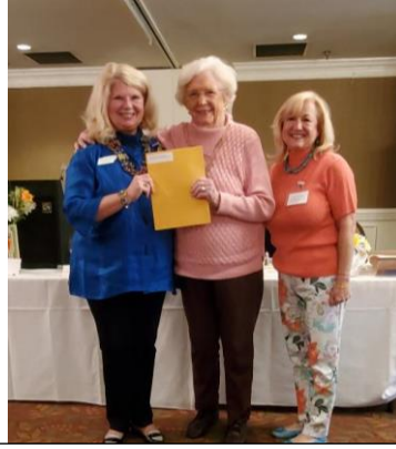
West Hills – Illy Wood