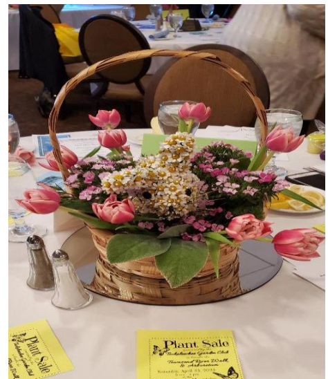
Floral Designs created by Garden Clubs were sold. Clubs kept the money.