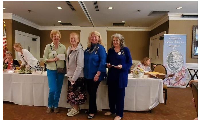
Club designs were judged, and cash prizes awarded. The winners were Flower Lover’s first place ($75.00); Eastside second place ($50.00) and Arissa, third place ($25.00).