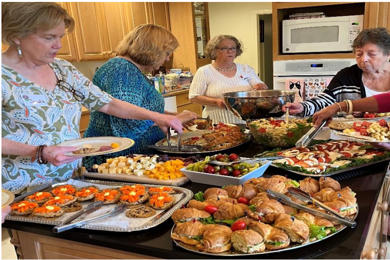
The Grand Buffet by Rothchilds Catering