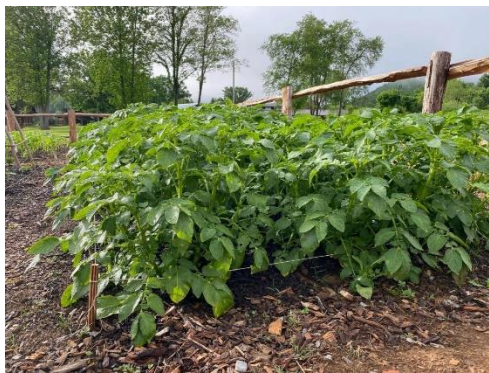
German Butterball Potatoes grown in the GSMHC Kitchen Garden.

Please make plans to join us any morning (or every morning!) next week for this living history demonstration! The program is free to all.