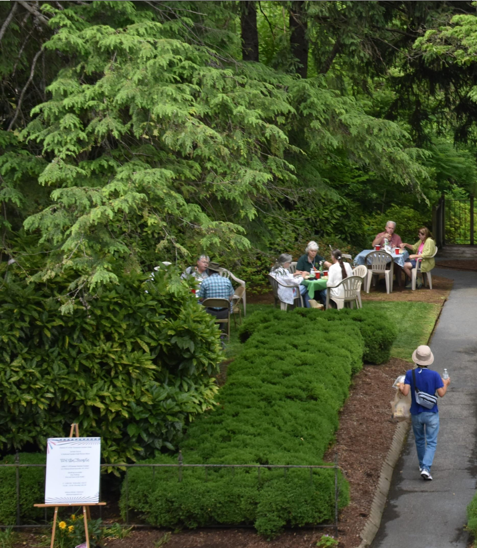
Dixie Regional Hosta Convention guests dining in the gardens at Racheff.