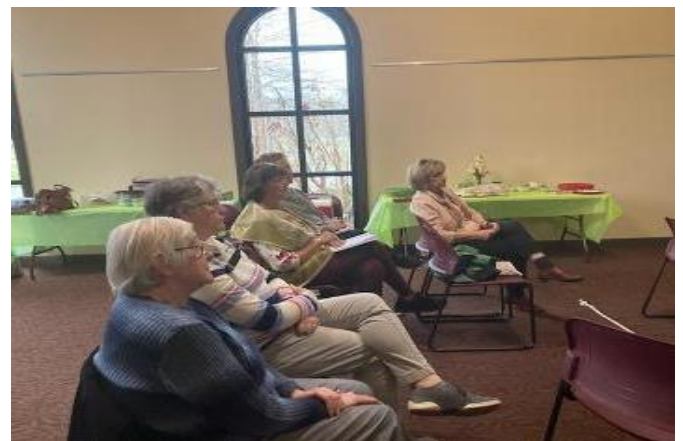
Members at Powell Library