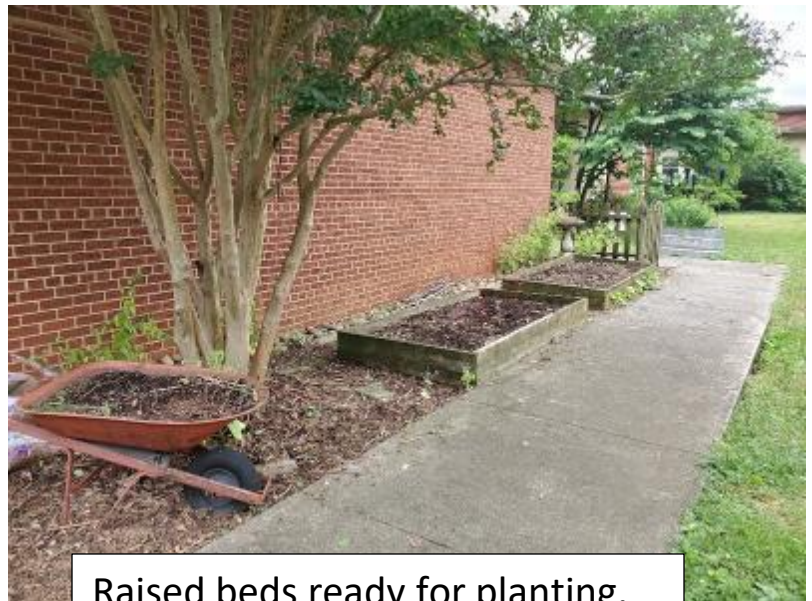
Raised beds ready for planting.