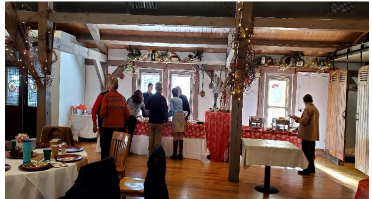
The Townsend River Walk decorated for Christmas.