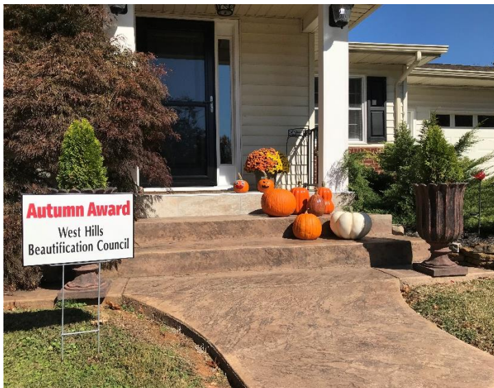
West Hills Beautification Council, October winner