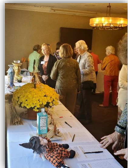
Shopping at the silent auction in Brassies