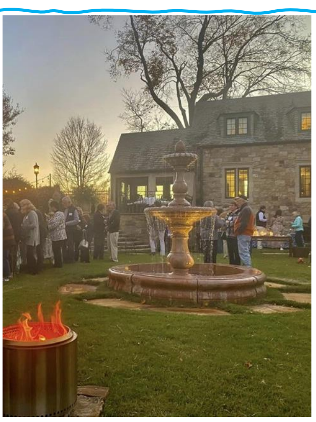
Our fall social was a garden party on a chilly mid-October evening. Drinks and hors d'oeuvres were served, as well as S'mores.